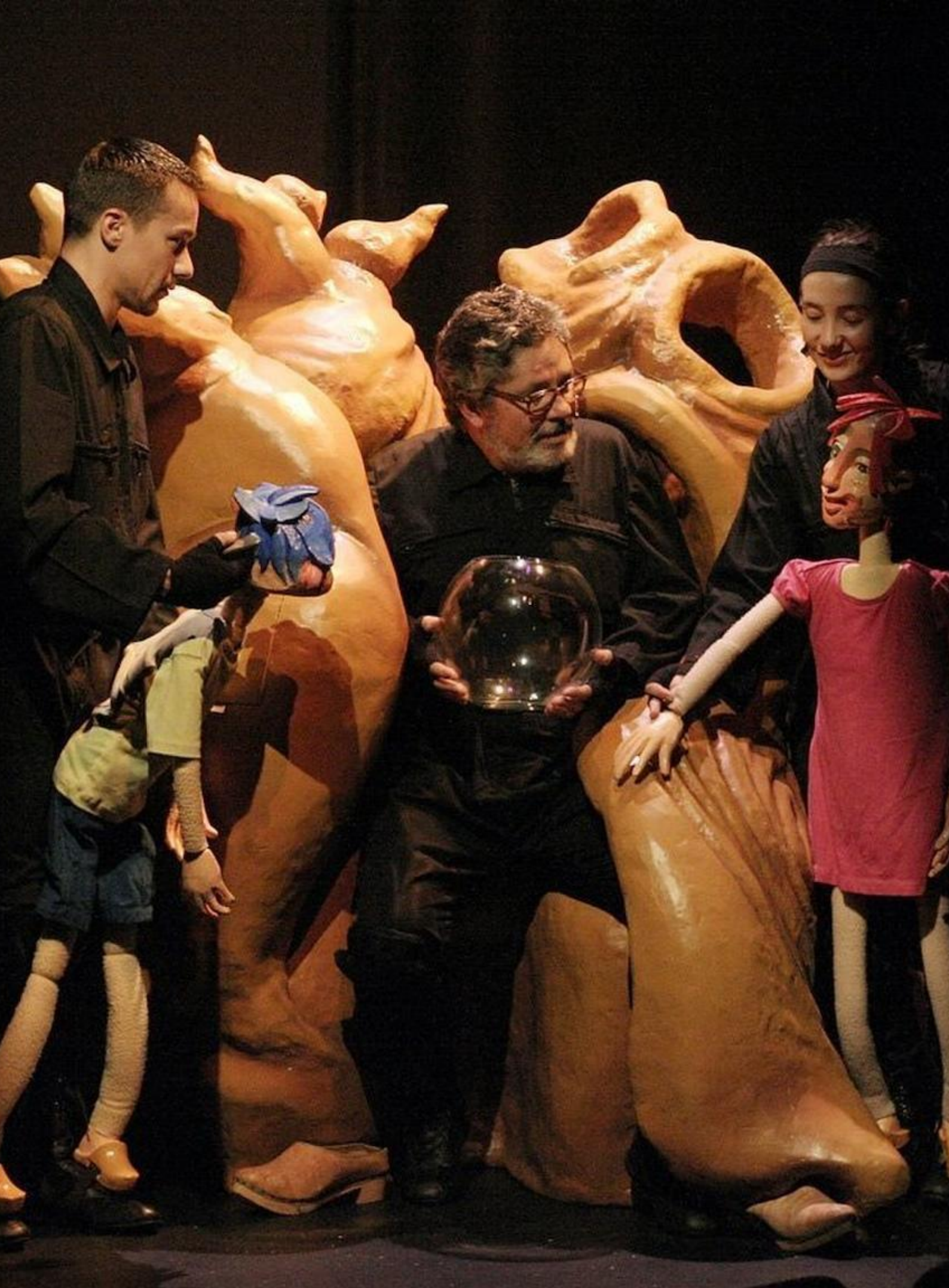
CERT · ANDAR NAS NUVENS